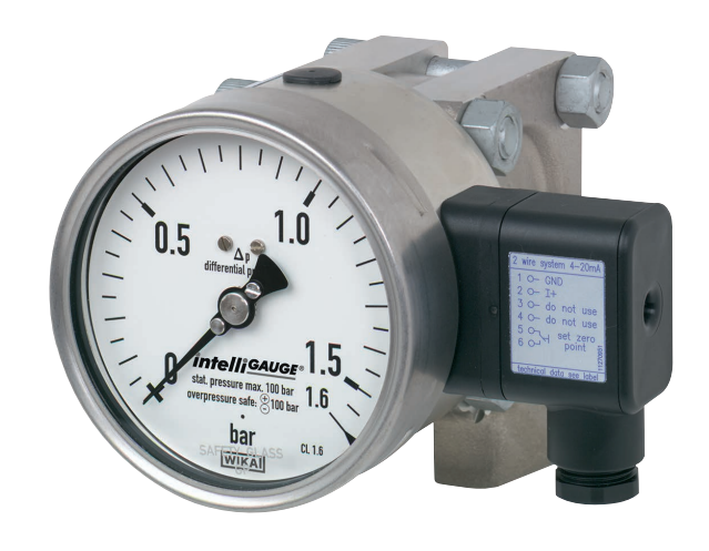
Differential pressure gauge, model DPGT43HP.100

The robust diaphragm measuring system produces a pointer rotation proportional to the pressure. An electronic angle encoder, proven in safety-critical automotive applications, determines the position of the pointer shaft – it is a non-contact sensor and therefore completely free from wear and friction. From this, the electrical output signal, proportional to the pressure, of 4 ... 20 mA, is produced. In addition, the electrical zero point can be set manually.